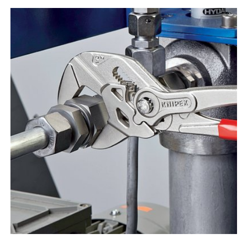
replaces the need for sets of metric and imperial spanners